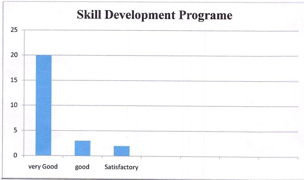
Number of Students VS Satisfaction Level

From the above Bar chart, it is understood that the students of computer science engineering enthusiastically learnt the basic computer Skill program, which worked as a foundation enabling the students to learn more computer programming skills.