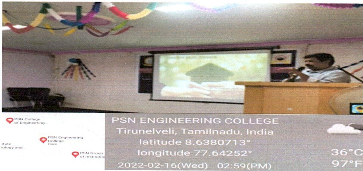
Students Interactions with Chief Guest